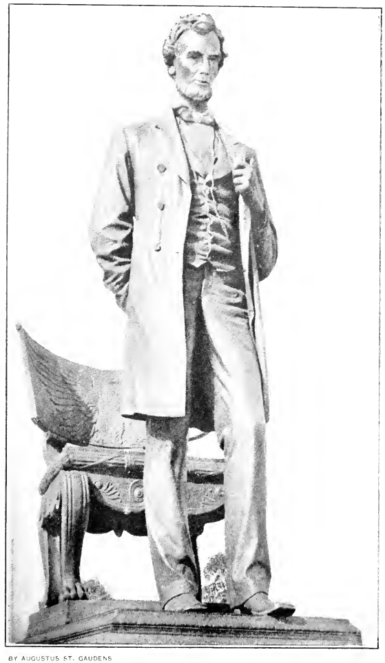
BRONZE STATUE OF ABRAHAM LINCOLN In Lincoln Park, Chicago